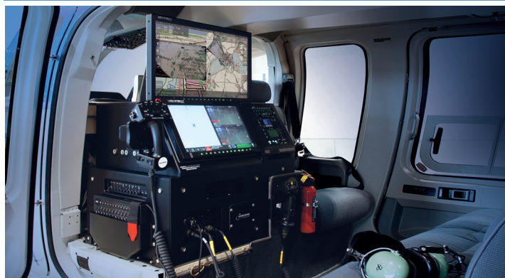
Bell 407 Polish Police, Operator Workstation